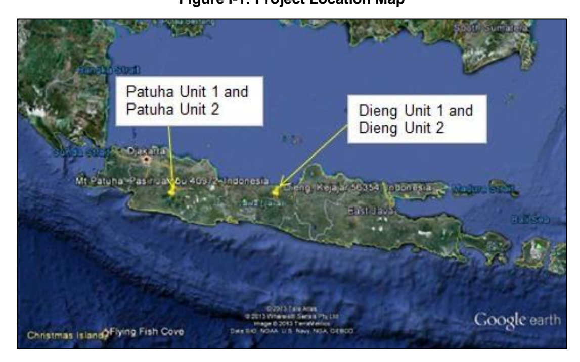
Figure I-1: Project Location Map