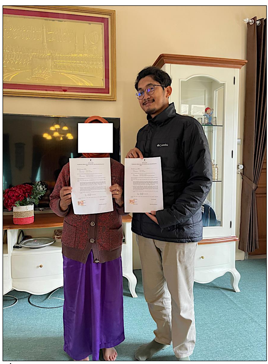
Pad 9 landowner